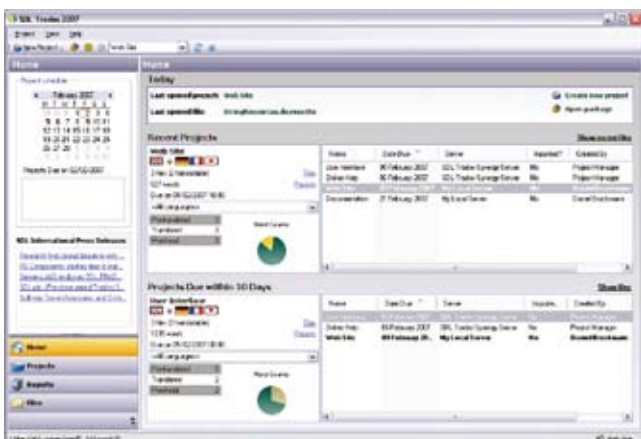
SDL Trados 2007 Suite Professional – Project manager dashboard view

Innovative project management automation and powerful quality assurance checks designed to drastically cut file preparation and manual quality assurance for the Translation Supply Chain