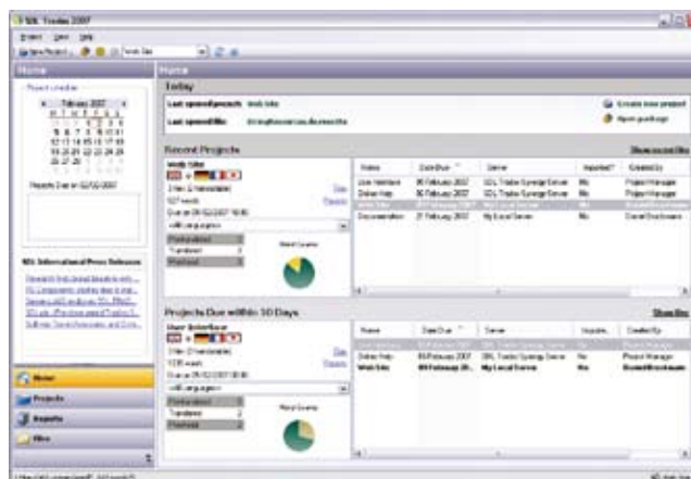
Easily track if projects are early, on-time or late

As a result, the same sentence never needs to be translated again and you can re-use what you have translated as often as you want. Integration with the new SDL MultiTerm 2007 provides powerful terminology lookup and search functions to ensure adherence to corporate terminology and dramatically reduce translation time.